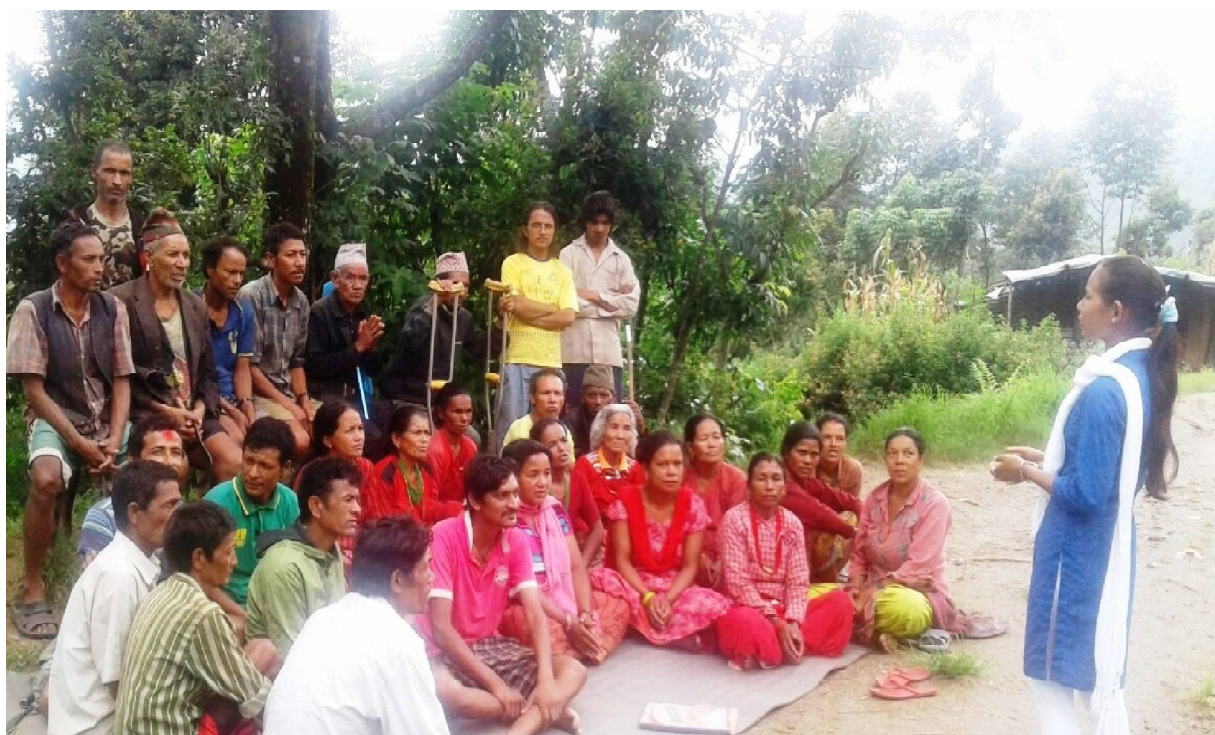
Parents' session on child protection

on children's need and protection from different kinds of child abuse and harm (especially from being trafficked). Thus, the whole session was focused on present issues of children insecurity and developing strategy to avoid such harms. As a whole, 51 females and 71 males got benefited through this event.