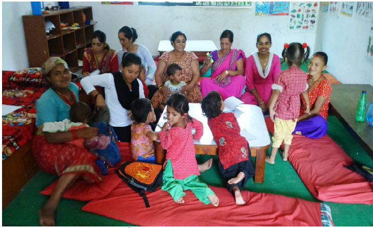
ECD mother groups reformation program in Indreswori Secondary & Jageswori Basic School