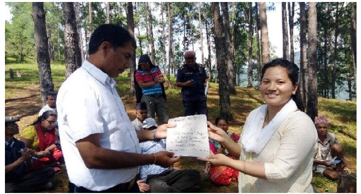
Organize VDC level interaction on anti-child trafficking