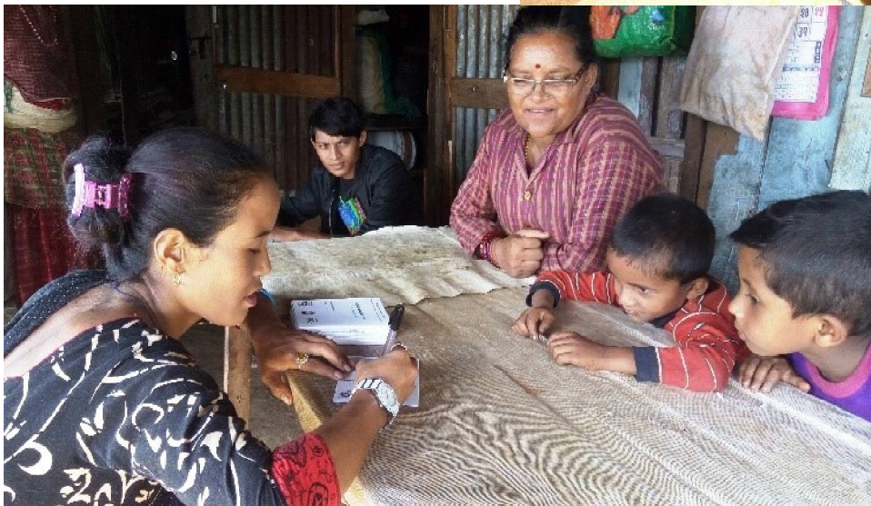
Social mobilizer filling the tracking form

high vulnerable rate), YELLOW (means in the process of vulnerability) and GREEN (means less vulnerability). There are fifteen questions and indicators which help to find out the situation of vulnerability of the children. The tracking is being done in close collaboration with Village Child Protection Committees (VCPCs). The tracking will be fruitful in making the efficient data base of children in all the targeted VDCs.