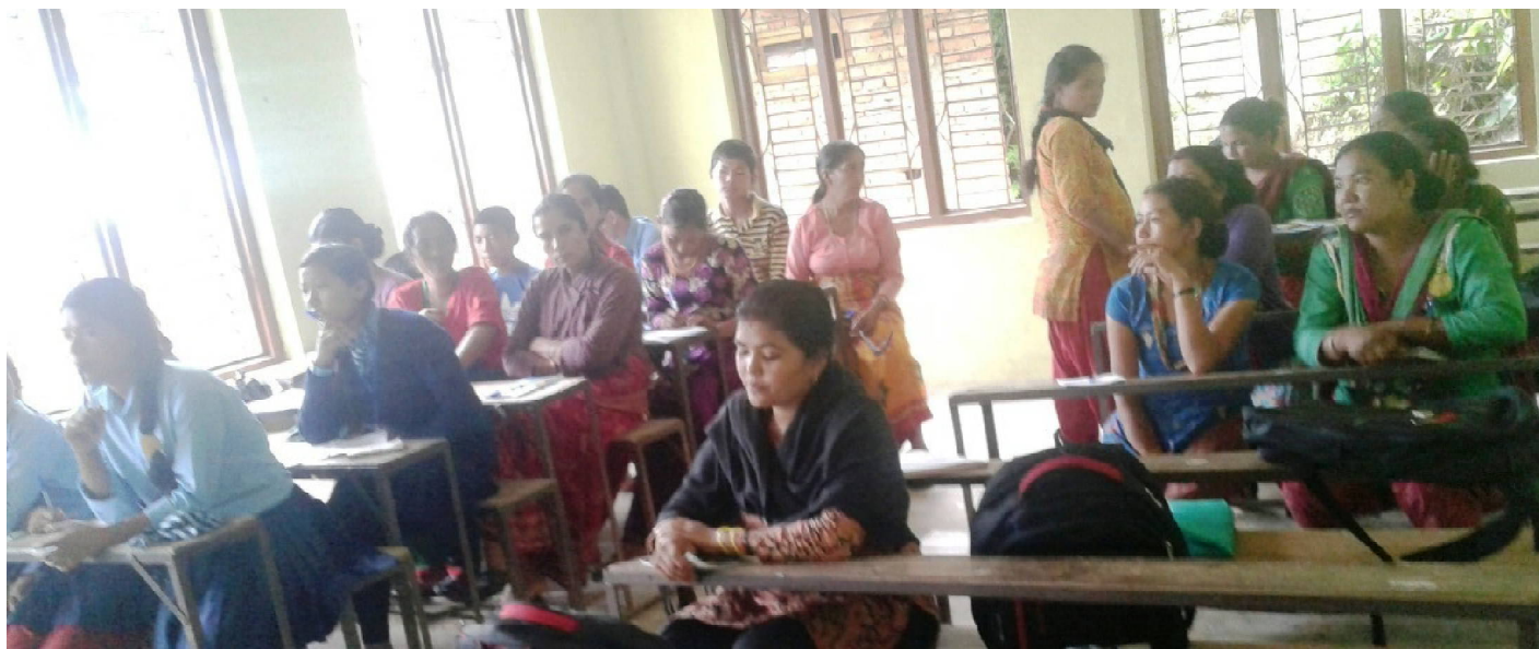
Community Alert System established

issues of child and women trafficking. Also, CAS defined the ways of coordinating with different child and women protection groups on child protection issues, especially child trafficking. All together 244 males and 143 females had participated during CAS establishment.